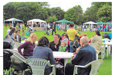
The community getting to know each other