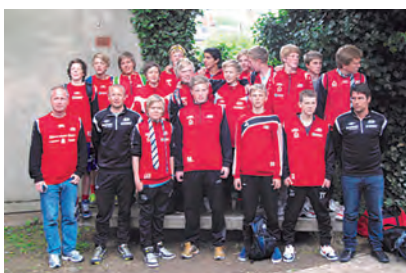
The Norwegian squad