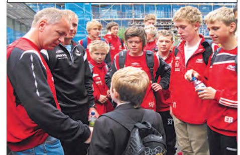
Meeting our pupils