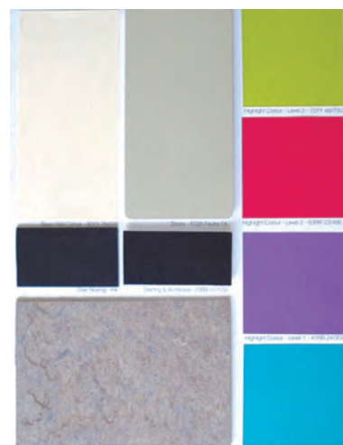
Key Space 1- Circulation