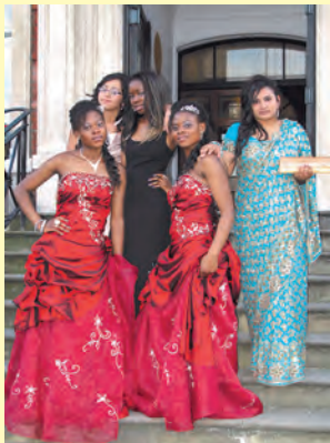
The girls all dressed up and the boys made as a great effort too!