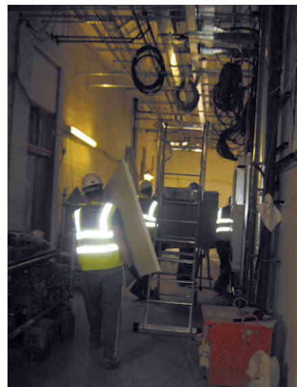
Builders hard at work in D Block