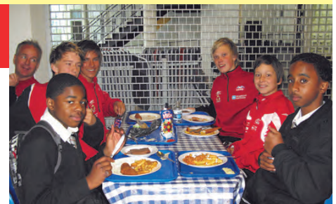
Enjoying their fish & chips