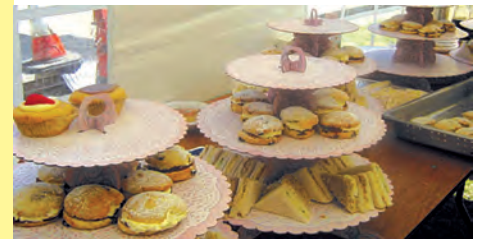
Delicious cakes made by our pupils.