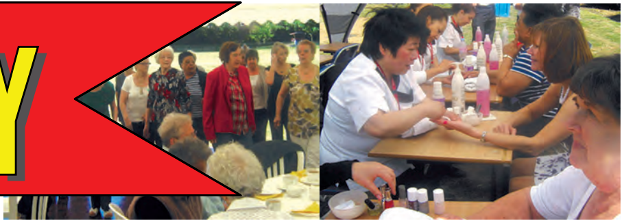
Senior citizens line dancing and being pampered.